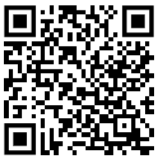
Morning session QR code